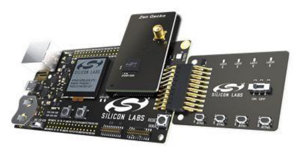
Figure 1: Main development board with Z-Wave SiP module